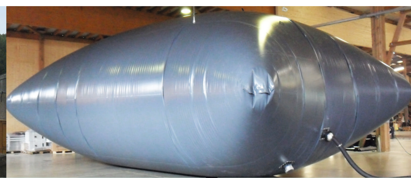
EXTERN FOILED GAS RESERVOIRS

Double membrane gas storage is the state of the art in biogas storage. This effective system is extremely robust and heavy duty.