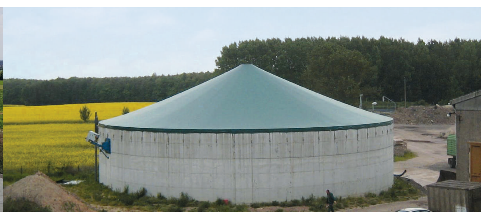
SINGLE MEMBRANE TENSION COVERS