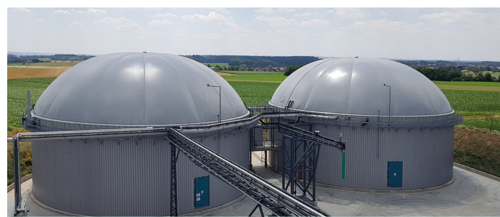
DOUBLE MEMBRANE GAS STORAGE